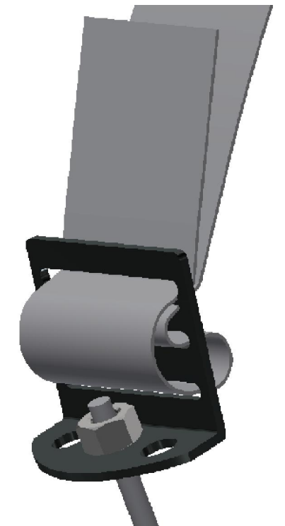
POLY BAND INSTALLATION DETAIL